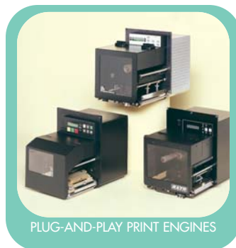
PLUG-AND-PLAY PRINT ENGINES