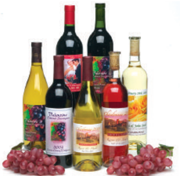
Wine Bottle Labels

The LX810 produces gorgeous, professional-quality labels for all your short-run, specialty products. It is also perfect for a host of other uses such as proofing before going to press on longer runs. Test marketing. Contract manufacturing. Private label goods. Promotional labels. Full-color box-end labels with all the required bar codes. And much more.