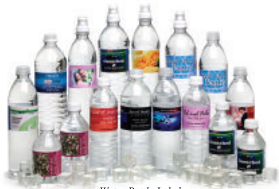
Water Bottle Labels

The LX810 prints onto many different label and tag materials, including inkjet coated high-gloss, semi-gloss and matte labels. Labels printed on high-gloss material are highly scratch- and smudge-resistant and virtually waterproof. This is a perfect solution for primary or box labels that can be exposed to water, rain and snow.