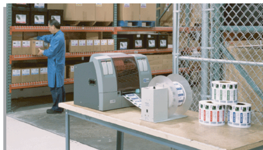
A VP2020 being used in a warehousing application. The inclusion of color fields and photo-like pictures on the label make it much easier to locate items and to quickly identify items that have been misplaced.

The revolutionary VP2020 label printer can produce vivid color codes and crisp pictures instantly on carton labels or tags, right on a bench top. Users can print labels one at a time or generate entire rolls with variable content such as barcodes, serial number, etc.