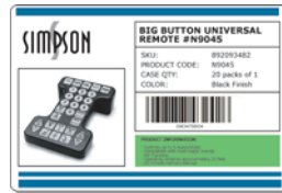
Discriminate Product Range by Color & Identify with Pictures