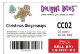
Discriminate Sell-by-Date by Color