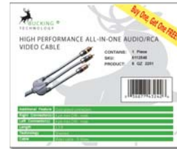
Differentiate product with Images & Run Customized Promotions

Other common applications include: discrimination of product size, location, handling level, product range, make or model, and others with color. With the addition of product images, you obtain easy recognition and can turn a simple label into a portable product brochure that moves through the supply chain.