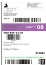
Discriminate Destination by Color